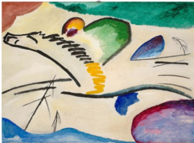
'Lyrical' by Wassily Kandinsky