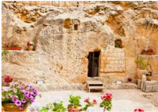
The Garden Tomb