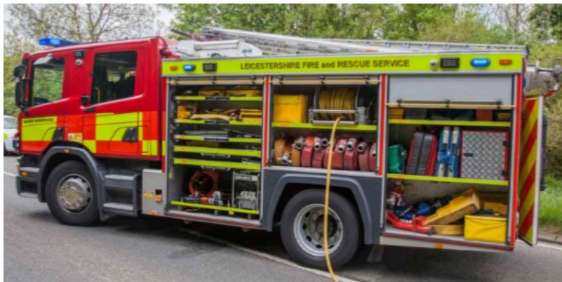
Modern Fire Engine