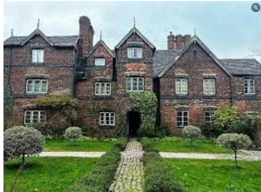
Mosely Old Hall