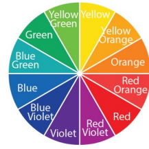
Primary, Secondary and Tertiary Colours