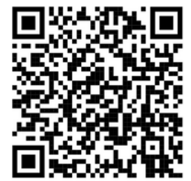
Let's Discuss: Fundamental British Values